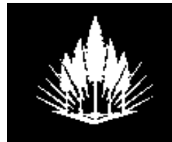
Area Health Education Center of SW Oregon